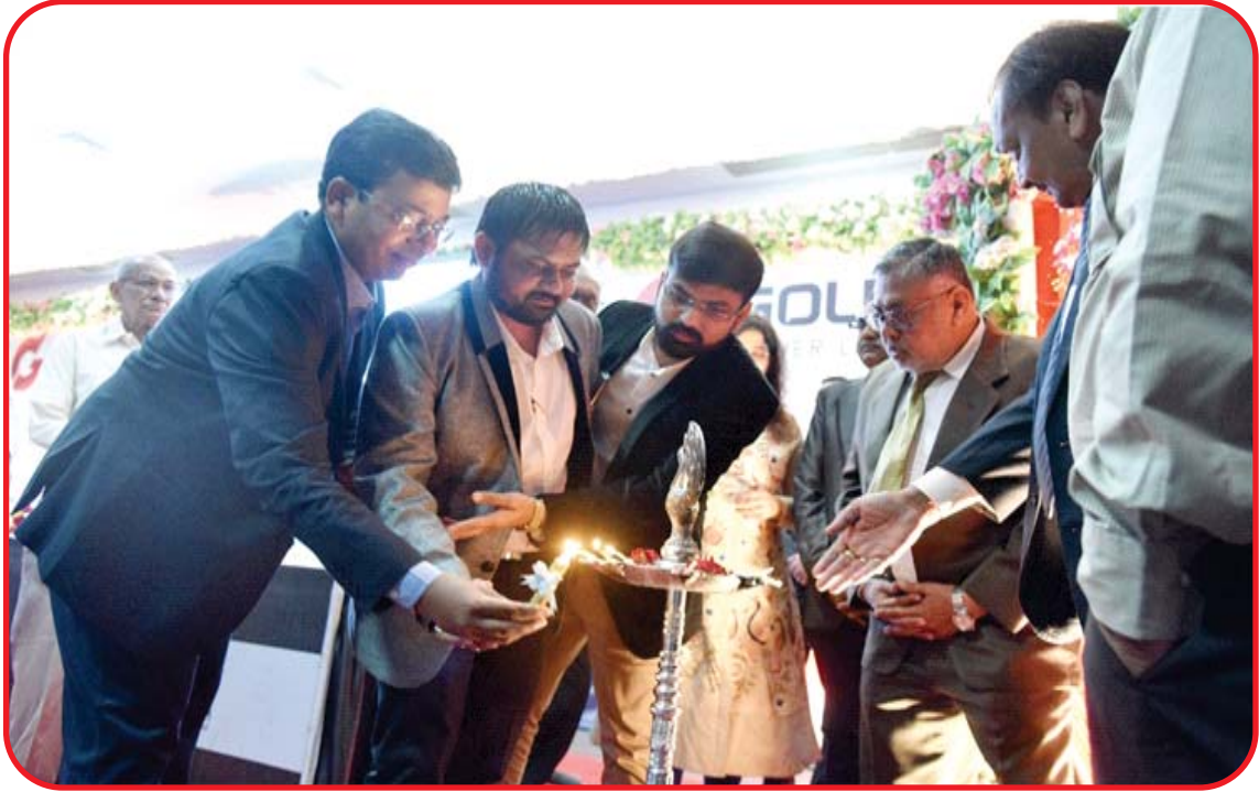
Dignitaries on Stage